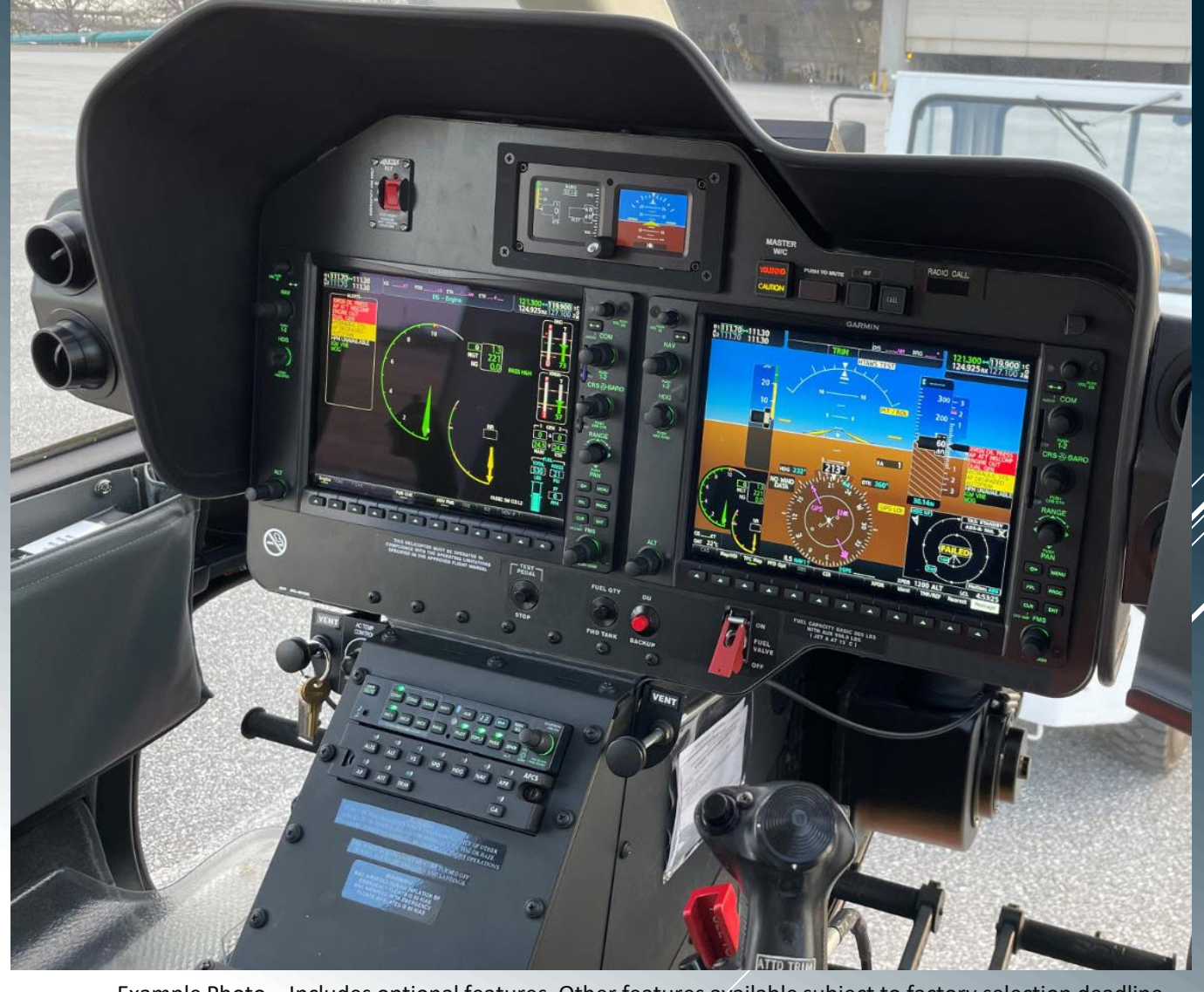
Example Photo – Includes optional features. Other features available subject to factory selection deadline.

Notes: [1] Database subscription updates are the responsibility of the helicopter owner/operator. [2] Integrated Marker Beacon Receiver capability is available with customizing of a Marker Beacon Antenna, and 3D Audio capability is available with customizing of stereo headsets.