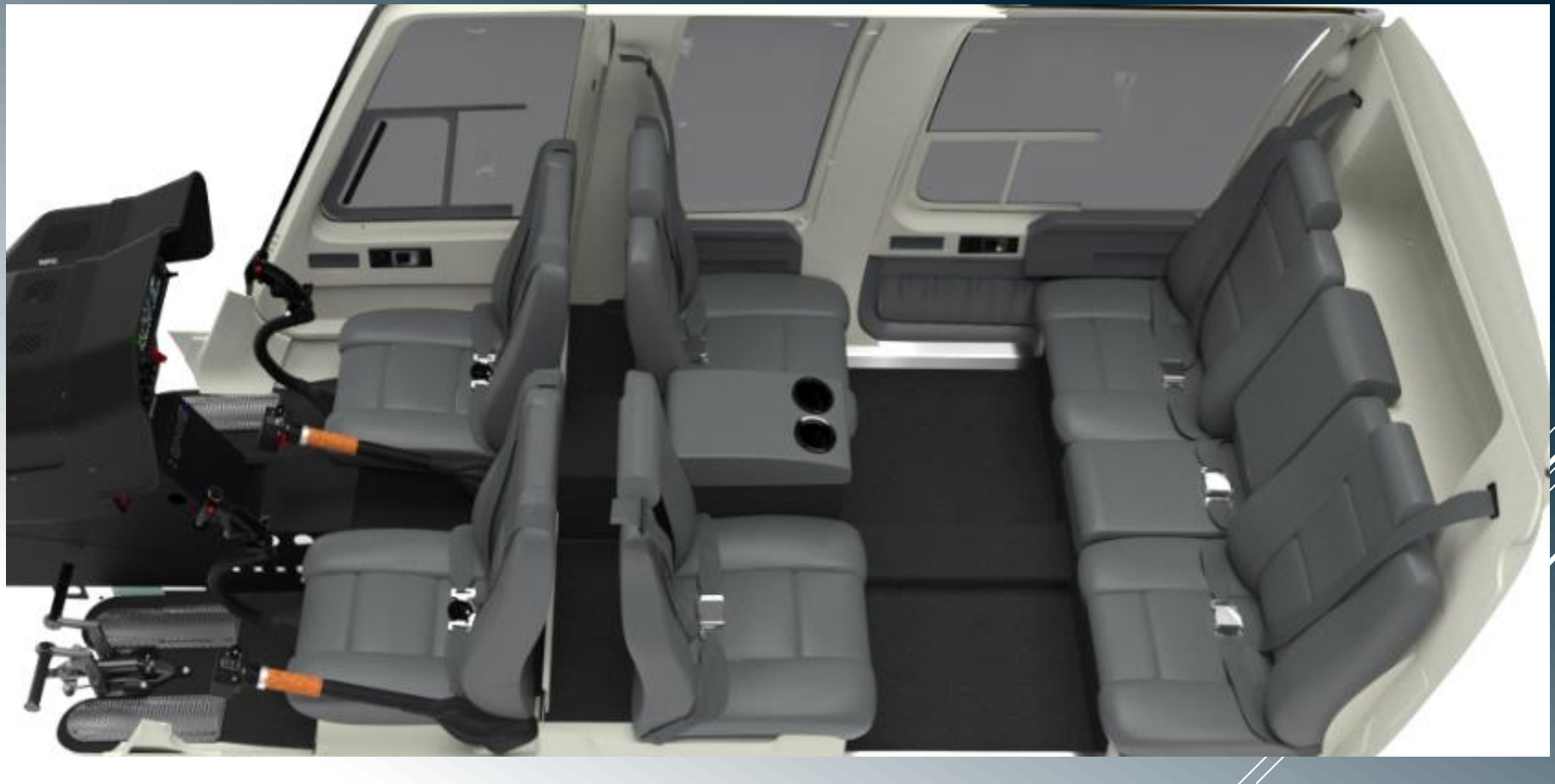
Gray All Leather Seats with Matching Seatbelts and Coordinated Wool Carpet

executive cabin seating consists of five 'overstuffed style' seats with individual seat belts and single strap a shoulder harnesses, arranged with two extra wide forward facing outboard seats and middle seat for occasional use across the rear of the cabin (with a fold down arm rest between the outboard seats) and two individual rearward facing seats aft of the cockpit. The executive interior trim consists of full plastic closeouts on all airframe areas, fabric covered outboard headliner blankets, and covered with color armrests coordinated leather. The flooring is 100% wool cut pile carpet.