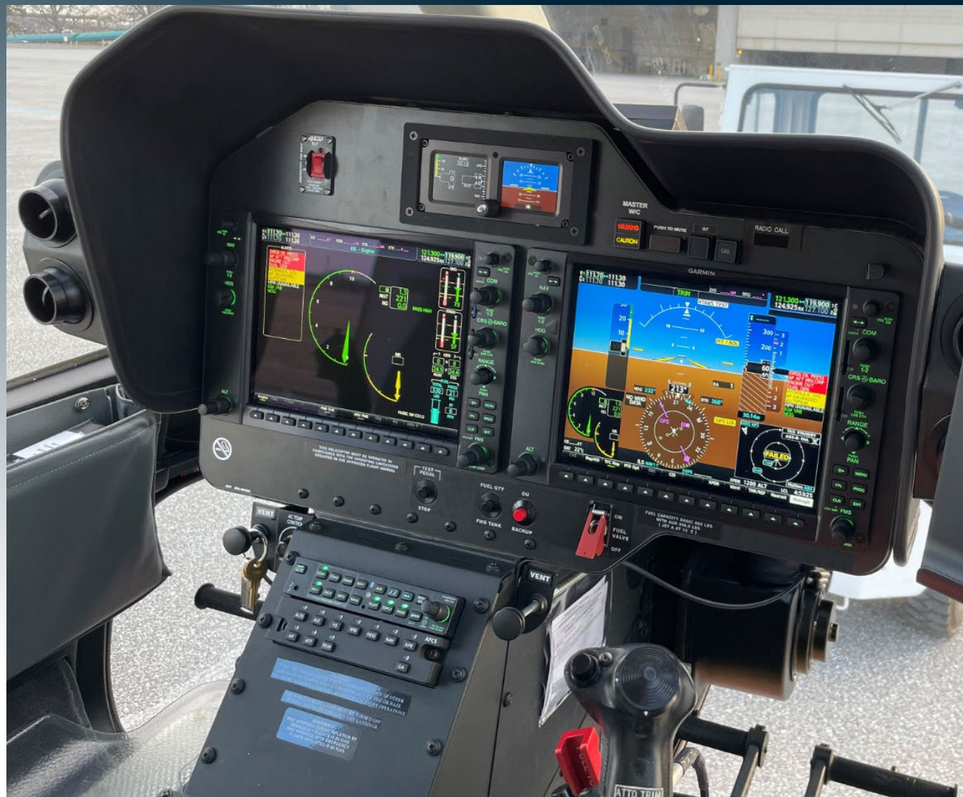
Example Photo – Includes optional features. Other features available subject to factory selection deadline.

[2] Integrated Marker Beacon Receiver capability is available with customizing of a Marker Beacon Antenna, and 3D Audio capability is available with customizing of stereo headsets.