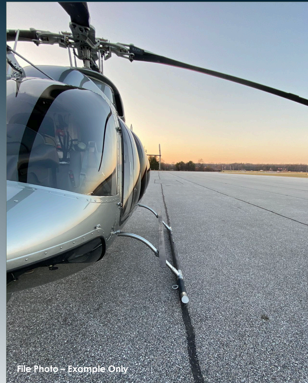
File Photo – Example Only