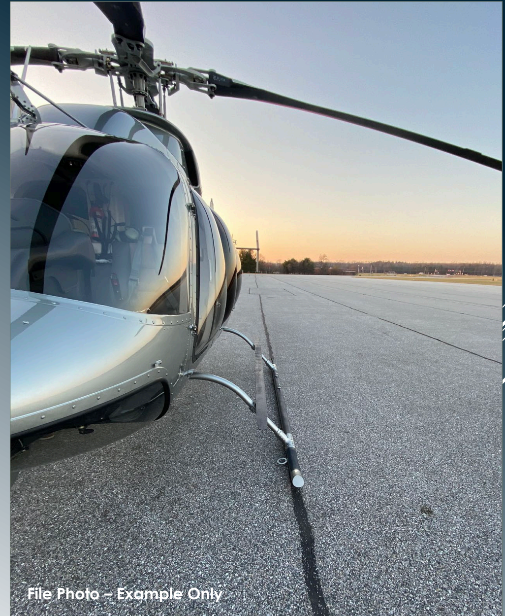
File Photo – Example Only