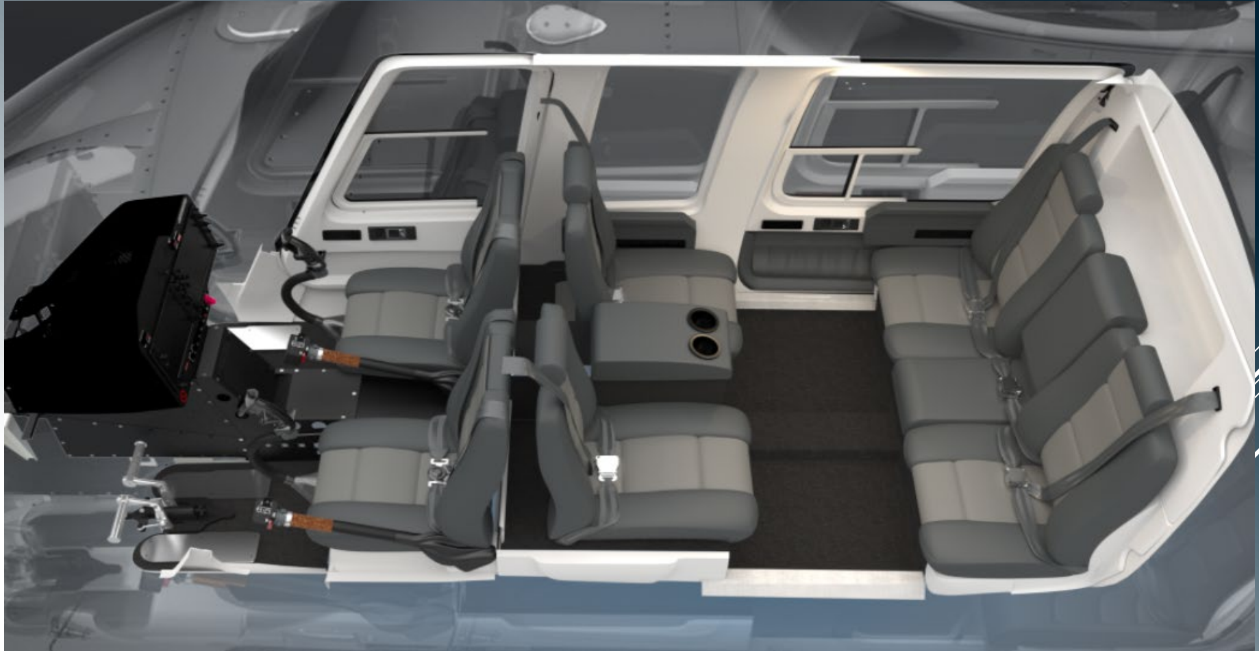
Two-Tone Gray All Leather Seats with Matching Seatbelts and Coordinated Wool Carpet

The executive cabin seating consists of five 'overstuffed style' seats with individual seat belts and single strap a shoulder harnesses, arranged with two extra wide forward facing outboard seats and middle seat for occasional use across the rear of the cabin (with a fold down arm rest between the outboard seats) and two individual rearward facing seats aft of the cockpit. The executive interior trim consists of full plastic closeouts on all airframe areas, fabric covered outboard headliner blankets, and armrests covered with color coordinated leather. The flooring is 100% wool cut pile carpet.